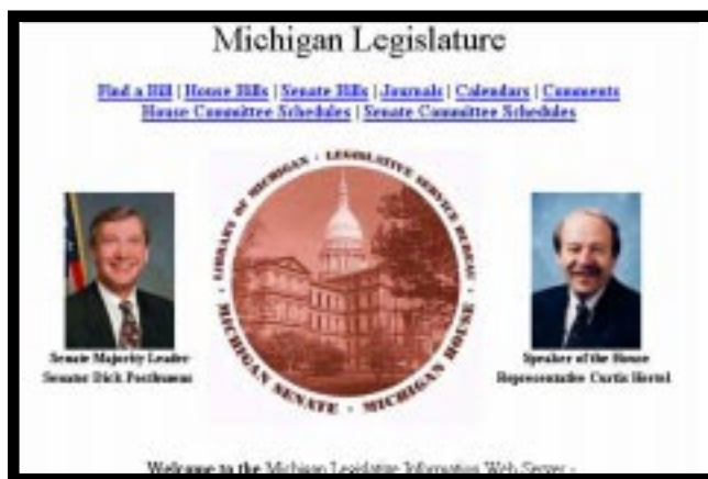
Figure 1. This is a sample of looking at information on the Internet with a graphical browser such as Netscape Navigator or Internet Explorer.

*It's possible to connect with less powerful equipment and less RAM, but your system may run very slowly.