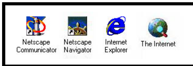
Figure 3. Icons such as these generally indicate that your computer has browser software pre-installed. You'll just need to enter a few settings to start surfing the Internet!